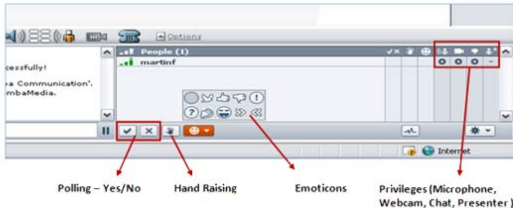
Figure 2. Screenshot showing Interaction options

Toward the end of the fall semester, a questionnaire was administered electronically using SurveyMonkey ©. The researchers sent an email with a hyperlink to the survey and a brief message about its purpose. Students were informed that their participation was voluntary, not connected to their course grade, and that the survey was anonymous. The survey was available for a three-week period, and during this time, two email reminders were sent.