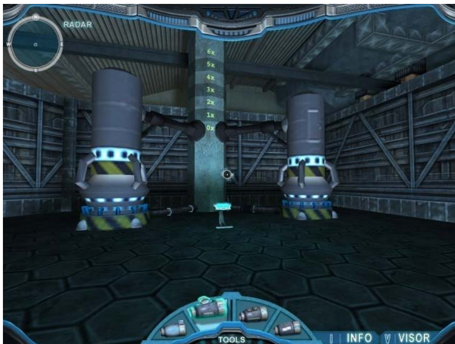
Figure 1: A typical screenshot from Tabula Digita's Dimension-M .

To support student learning, the game features a built-in journal that allows the player to review any of the game dialogue as well as the math concepts presented in the game. These tools provide a way for students to review mission objectives and to learn about the math concepts addressed, often with worked examples. At the close of each mission, the student is presented with a quiz, integrated into the game's storyline, which includes both multiple-choice and short answer questions about the mathematics concepts they learned in the mission. At the close of the mission the results of this quiz and their game play are used to calculate an overall mission score. The players are then rewarded with a gold, silver, or bronze medal.