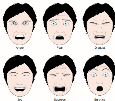
Fig. 1. Basic Emotions - Facial Expression [25]

of the information entities in day to day life. Internet naturally poses a wider platform for expressing this kind of emotional information. One such prominent platform is ‘Social Media’ which includes online social networks like ‘Facebook’ and microblogs like ‘Twitter’ [11].