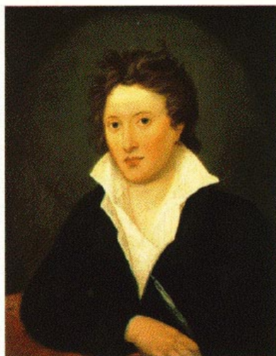
Percy Bysshe Shelley